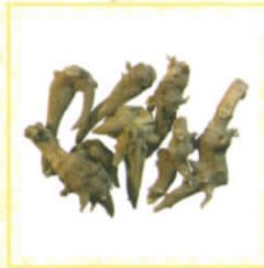
Unprocessed Radix Aconiti Kusnezoffii