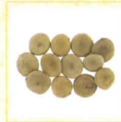
Unprocessed Semen Strychni