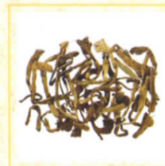
Flos Daturae Metelis

The 31 Chinese herbal medicines specified in Schedule 1 of the Chinese Medicine Ordinance have strong or very strong toxic effects / potency.