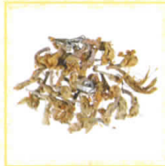
Flos Rhododendri Mollis