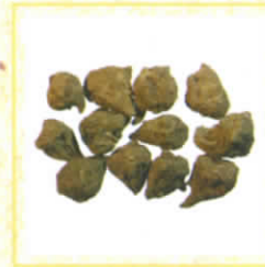
Unprocessed Radix Aconiti