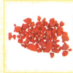
Cinnabaris (Cinnabaris in lumps)