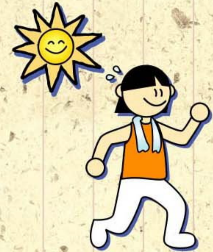
Good health with sufficient qi and blood