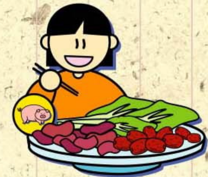
Eating red dates, spinach and lean meat can help replenish your blood