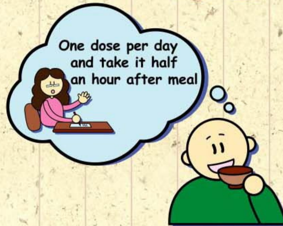
Complying with the instruction of Chinese medicine practitioner