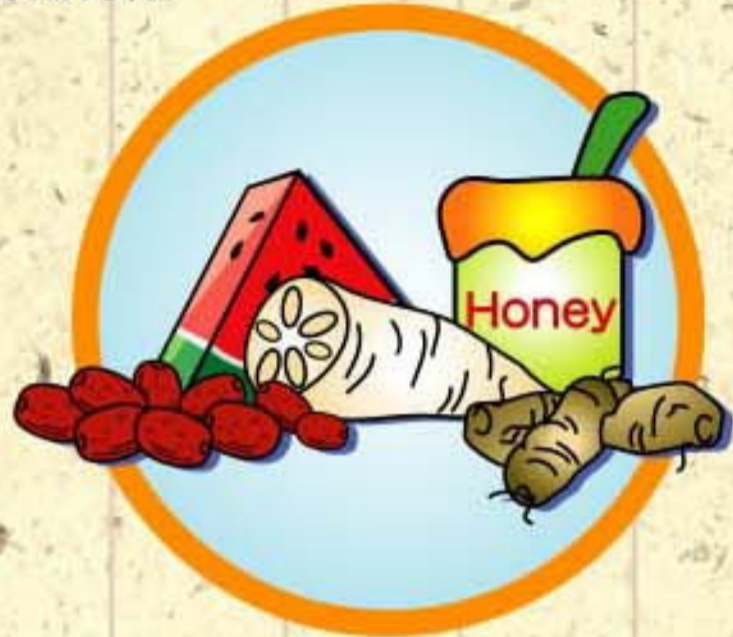
Red date, water melon, lotus root, honey and ginger are used daily as food. They can be used for medicinal purposes.