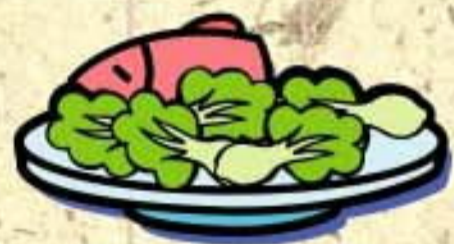
Maintaining health in everyday life