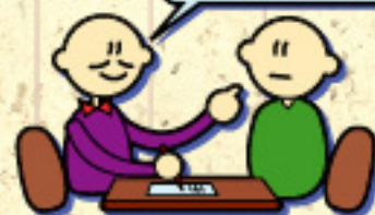
Registered Chinese Medicine Practitioner