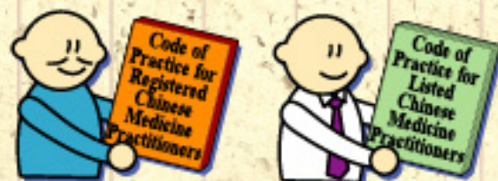
Registered Chinese Medicine Practitioner

Third, their codes of practice are different.