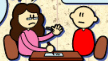
Listed Chinese Medicine Practitioner

I can't prescribe toxic Chinese herbal medicines